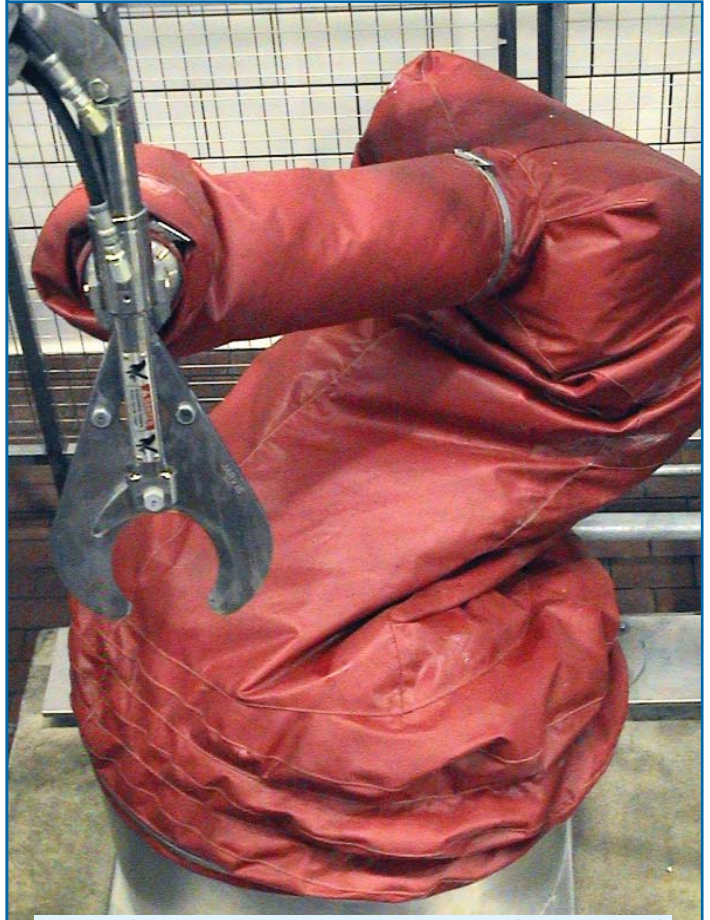
Photo of Jarvis' JR-50 hock cutter robot ("Little Vince") installed at Cargill's Schuyler, Nebraska beef processing plant. The robot is covered with a protective jacket, shielding the machine's internal electronics and mechanisms from potentially harsh environmental elements. Other features include a Real-Time controller with 3-D vision, and an adjustable angle of cut for allowing higher and better quality production yields.